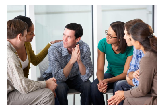
Written by: Chelsea Mandes, VSC's Victim Advocate Intern

Sexual assault is a hot topic these days: from the multiple alleged campus sexual assaults in the media, to allegations of rape against beloved celebrities and athletes alike, it seems that one cannot go a day without a new allegation of sexual